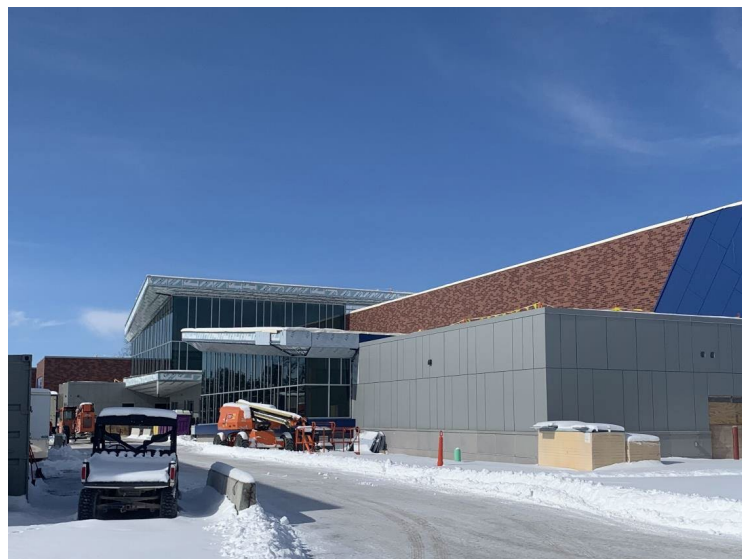
Exterior composite wall panel is continuing to progress.