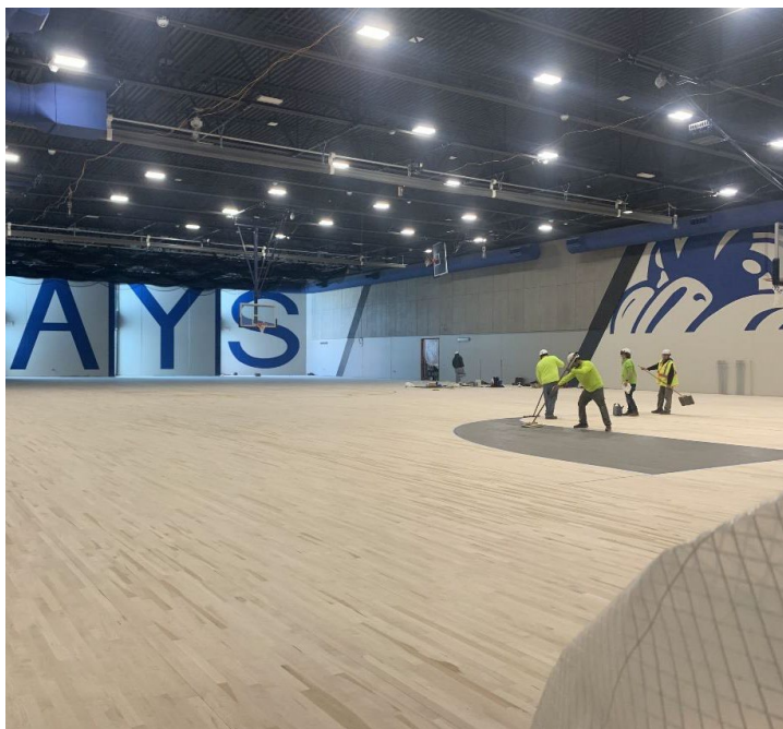
Gym floor has been laid down and staining and finishing are in progress.