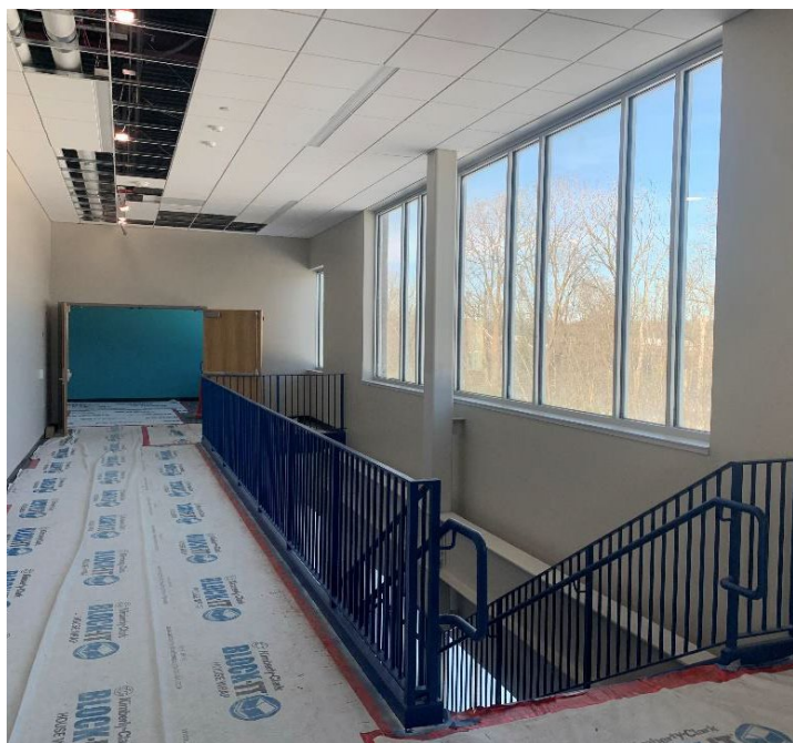
North stairway railings have been painted and stair nosing and treads have been installed.