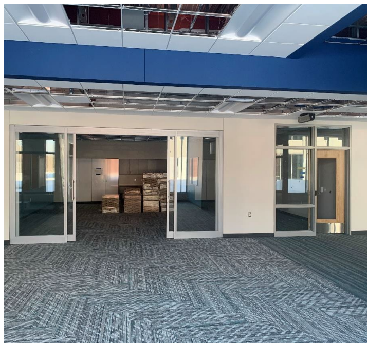
First-floor classrooms have received their sliding door systems.