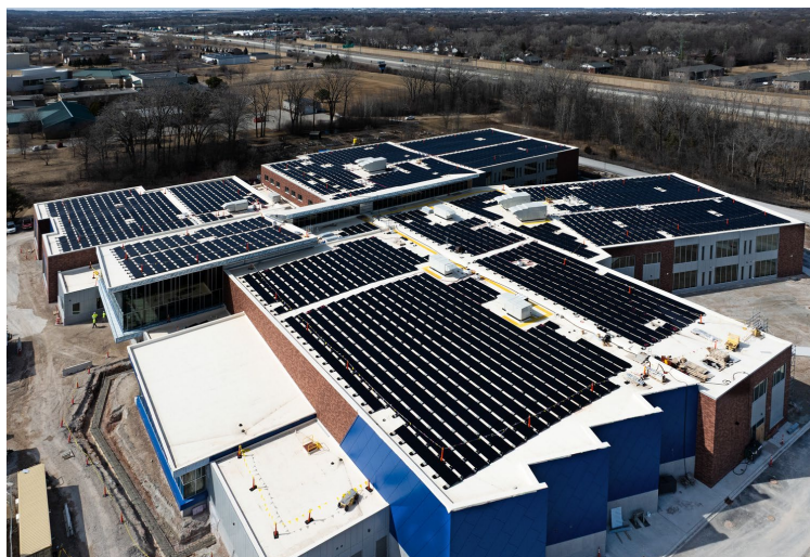
Aerial view of the expansive rooftop solar array.